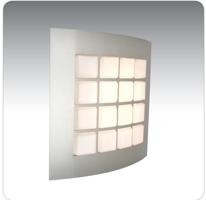
OPAL/ BLACK (QUAD10) & OPAL/SILVER (QUAD13)

UL or ETL Listed. Suitable for Wet Locations (interior or exterior use).